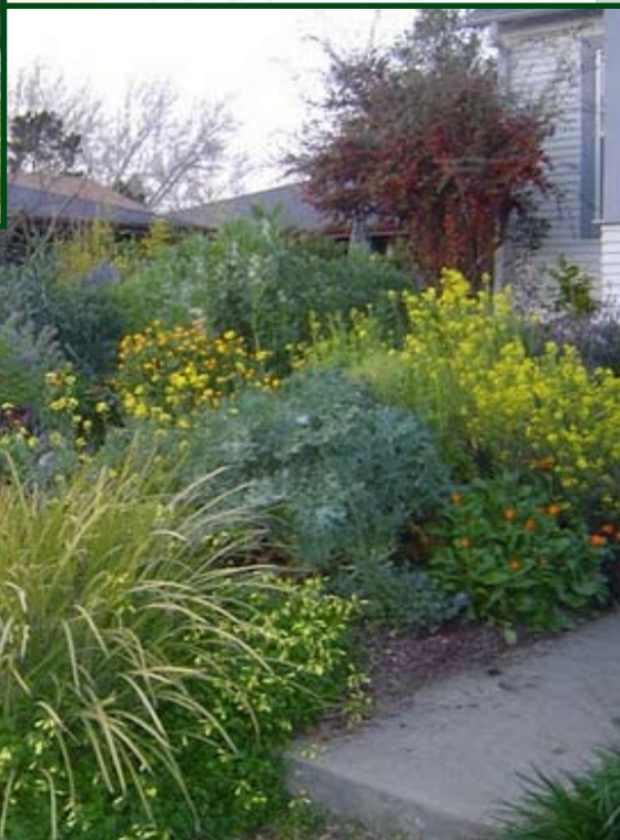
Before and after images from a Mulch Madness landscape renewal in the City of Petaluma.